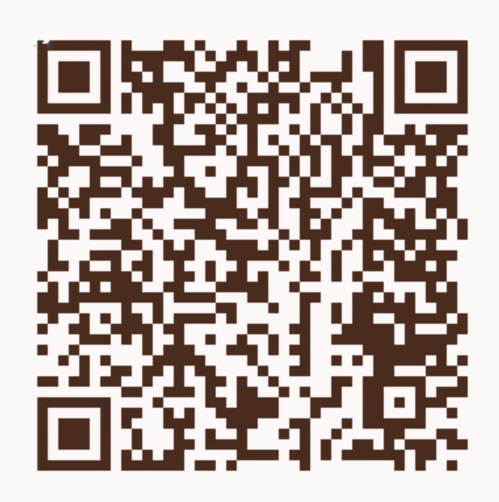
Scan for menu