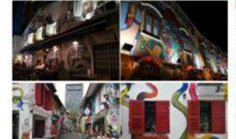
8. Explore the colours and flavours of Little India

Little fiddle is invalided worth of Kampoing Dlam in the Renford district, in addition to the good band and incredible shapping lyos pays have to drack out Mustafa Centre origin. He area is super-inspagnent and Look out for the eligible of installation along Hindox Roset. The extendible